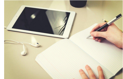
Practical Exercises (simple ones)